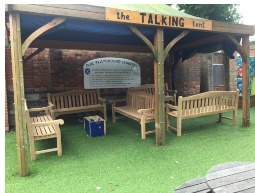
Above—we have new benches in our Talking Tent! Below—the design for our Reverence Values badge.

Lastly, attendance is looking really good this term, we're hoping to see lots of children earning their place at our Attendance Party at the end of term!