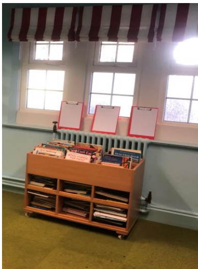
A large selection of books aimed at our nursery and EYFS children.