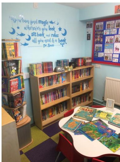
Inspirational reading quotes and an activity table that is changed regularly.