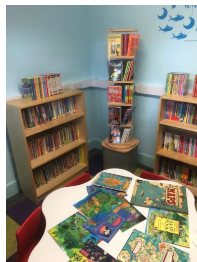
Hundreds of new chapter books for all year groups that are accessible.