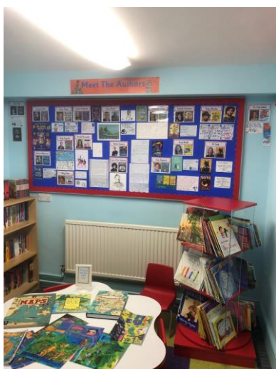
Lots of new quality picture books for use across the school.