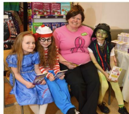
The pictures Asda took to display on their website.