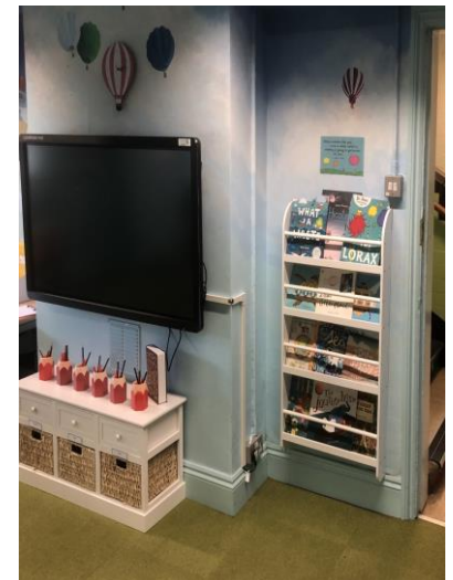
Themed books regularly changed and a computer with an Interactive Whiteboard (IWB).