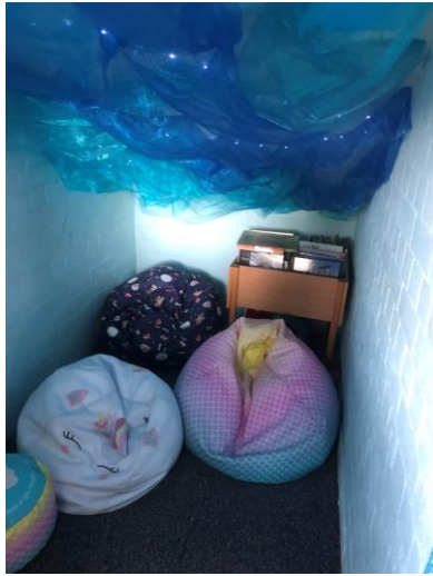
A reflection area with religious texts, including Bibles.