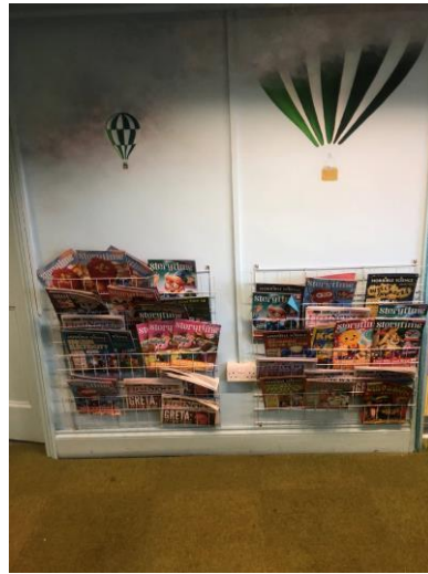
Magazines and newspapers that we have subscribed to.